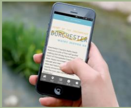
Visit Dorchester Cell Phone App – Pine Street Tour

Churches played a significant role on the Underground Railroad, providing sanctuary for freedom seekers and resources to help them resettle. Their important legacy uniting and sustaining African-American communities continued through the decades, and they emerged as leaders in the Civil Rights Movement.