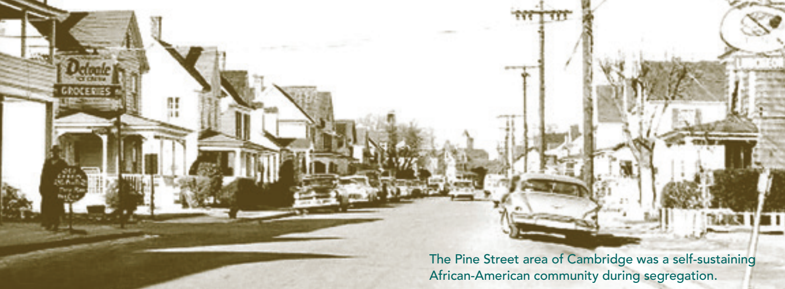
The Pine Street area of Cambridge was a self-sustaining African-American community during segregation.