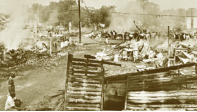
Pine Street after the fire destroyed two blocks of the community in July 1967.

and exhorted Blacks to be more aggressive in their struggle for equality. Several hours later, a fire broke out at Pine Street Elementary School, but firefighters were kept away from the blaze by city officials who feared for their safety after Brown's speech. The fire spread across two square blocks, reducing much of Pine Street's famous downtown to ashes. The cause of the fire has never been firmly established. This single event, however, in many ways came to define Cambridge and its Pine Street community in the national media.