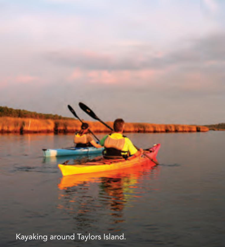
Kayaking around Taylors Island.