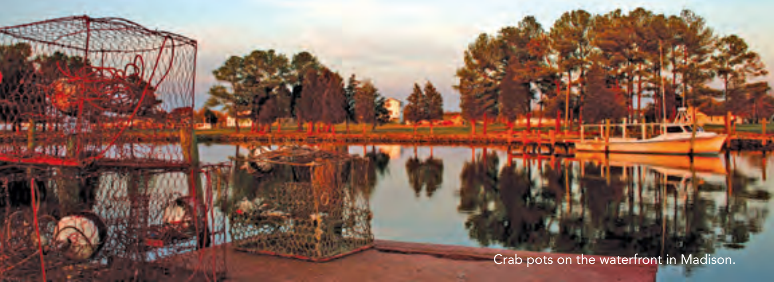
Crab pots on the waterfront in Madison.