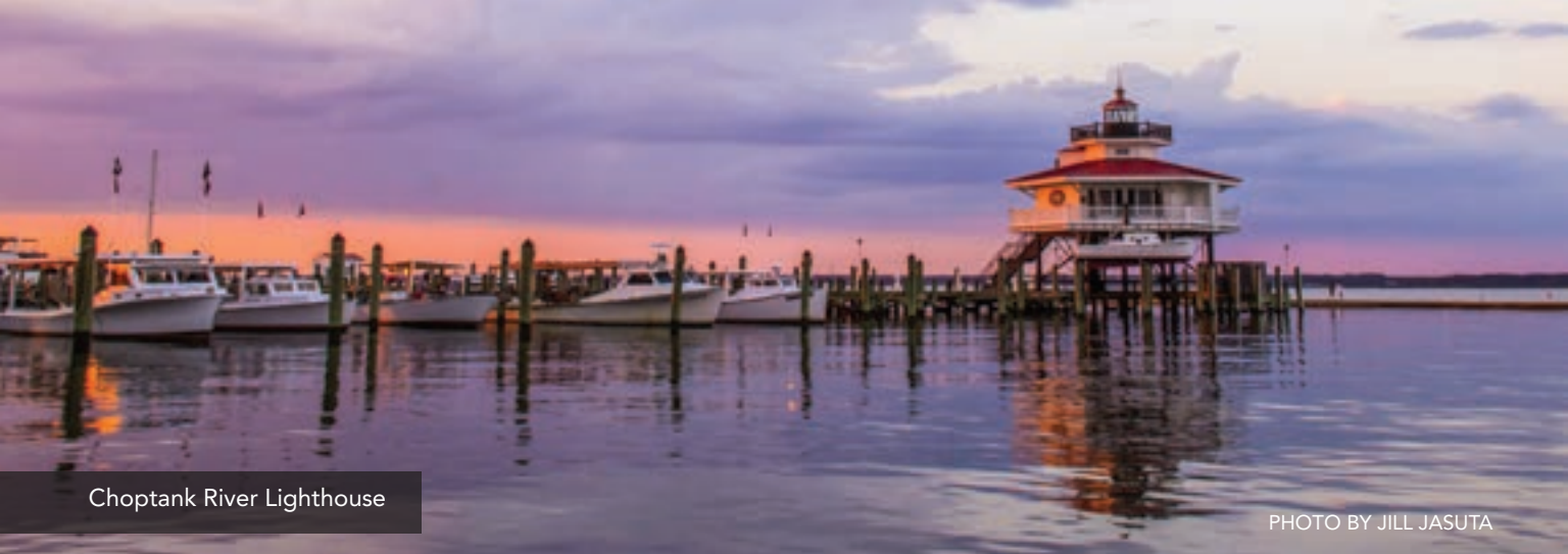
Choptank River Lighthouse