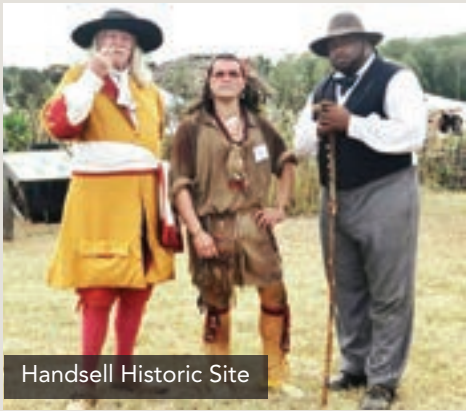
Handsell Historic Site

Dorchester is one of the oldest colonial counties in Maryland, with roots that date back to the 1600s. Historic churches, houses, schools, graveyards and mills are scattered throughout the landscape. Native American artifacts and relics from local tribes are exhibited in the local museums. In fact, most of Dorchester County has been certified as the Heart of Chesapeake Country Heritage Area.