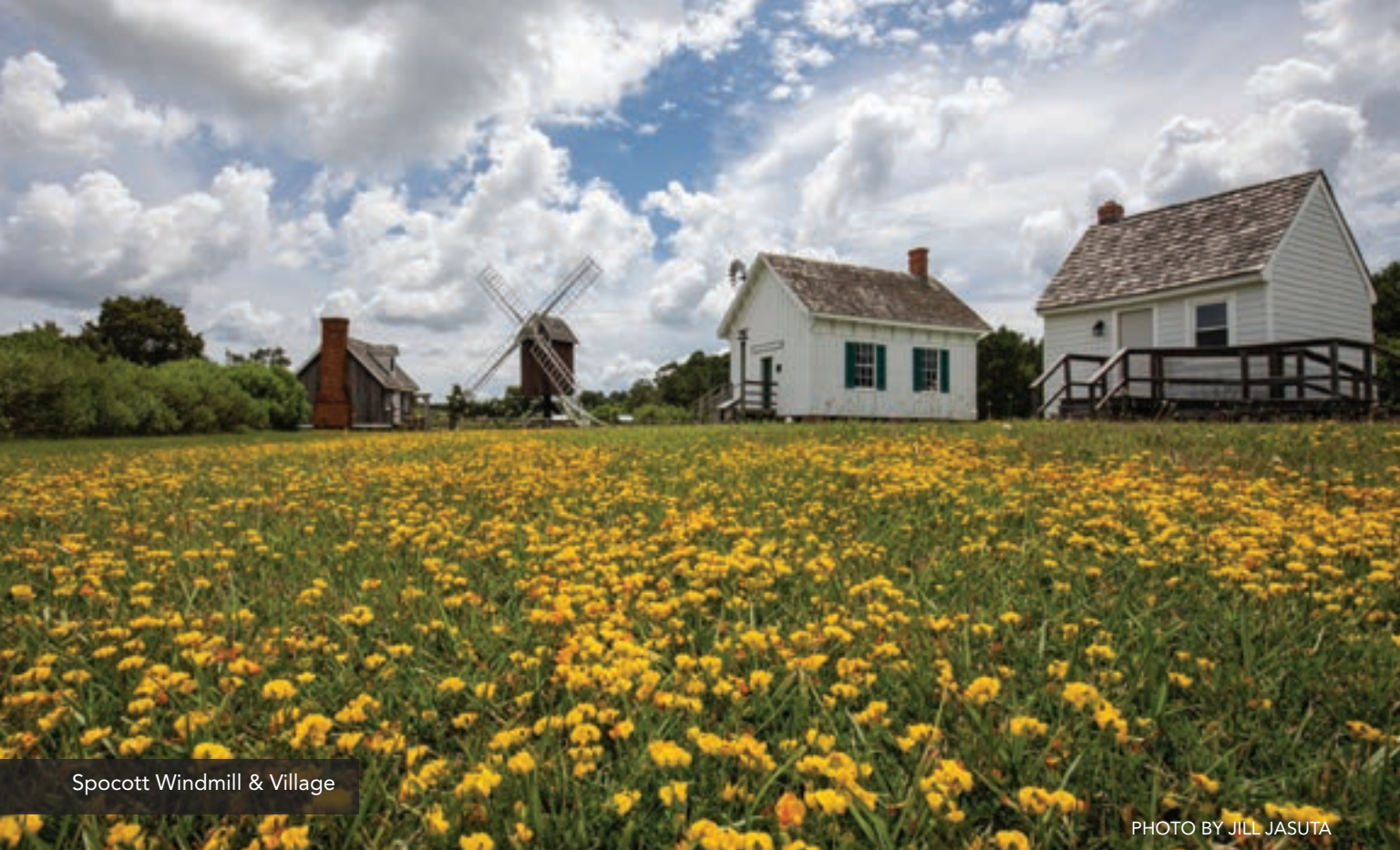
Spocott Windmill & Village