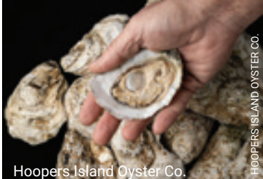
Hoopers Island Oyster Co.

Choptank River Crab & Oyster Co., 203 Trenton St., Cambridge; 410-228-CRAB, choptankriverseafood.com