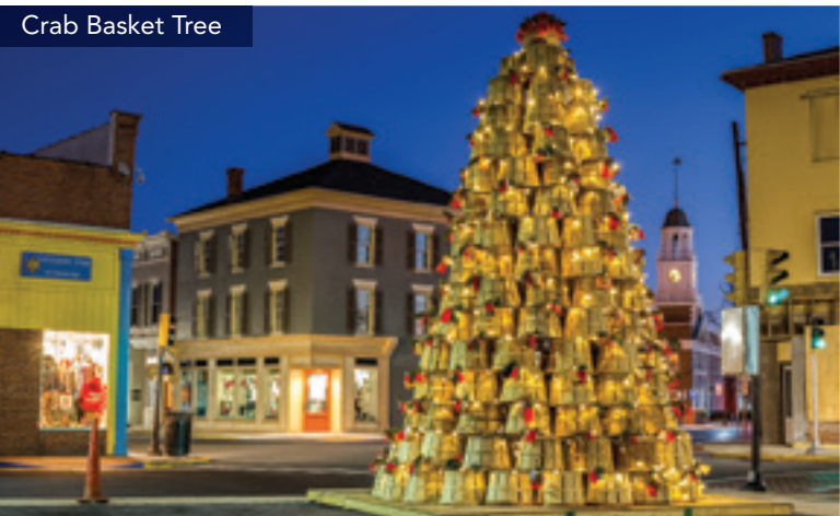
Crab Basket Tree

Vienna Luminaries and House Tours: 300-year-old town shares holiday glow with 1,500 luminaries, house tours, Santa, refreshments, music. Vienna. Dec. 16, 2017