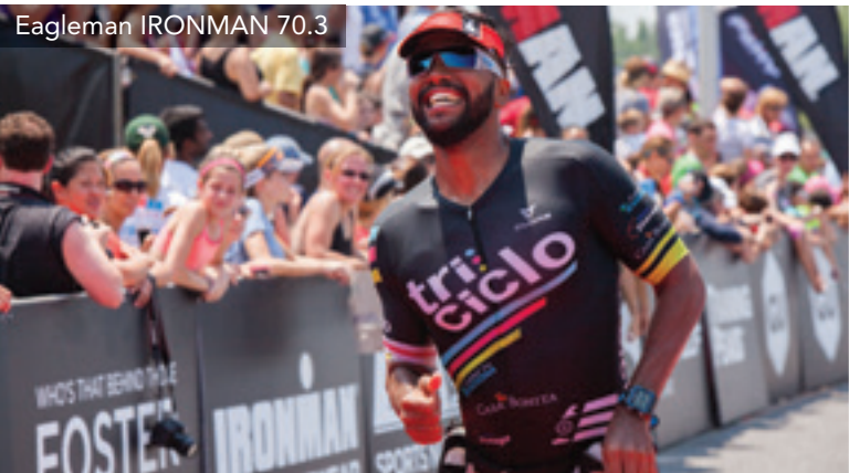
Eagleman IRONMAN 70.3

IRONMAN Maryland Triathlon: Oct. 7, 2017