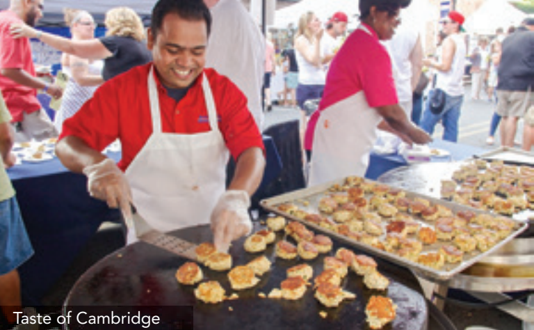
Taste of Cambridge